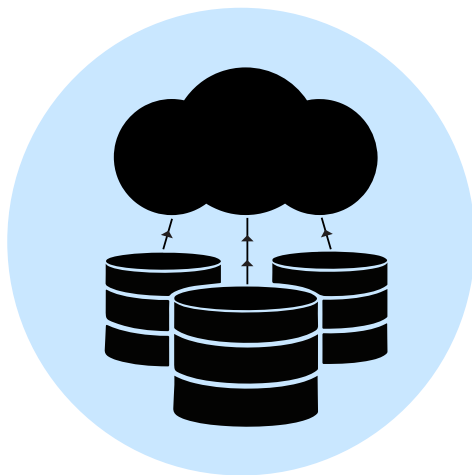
Qloud Cover Migration